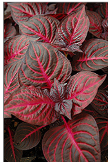
Blazin' Rose Blood Leaf foliage