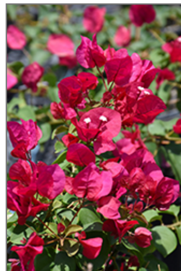
Barbara Karst Bougainvillea flowers