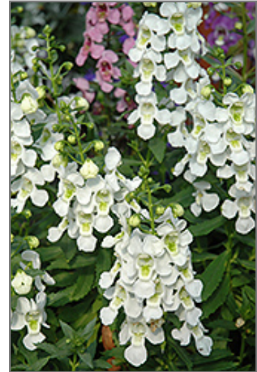
Serena White Angelonia flowers

Serena White Angelonia is a fine choice for the garden, but it is also a good selection for planting in outdoor containers and hanging baskets. With its upright habit of growth, it is best suited for use as a 'thriller' in the 'spiller-thriller-filler' container combination; plant it near the center of the pot, surrounded by smaller plants and those that spill over the edges. Note that when growing plants in outdoor containers and baskets, they may require more frequent waterings than they would in the yard or garden.