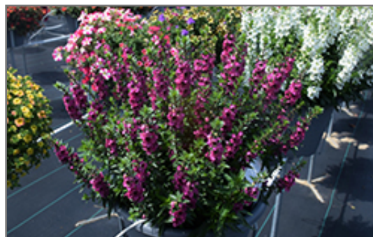
Archangel Raspberry Angelonia in bloom