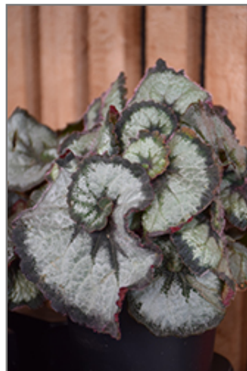
Escargot Begonia foliage