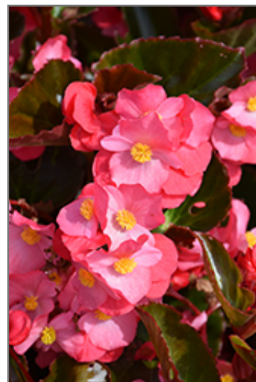
Big Rose Bronze Leaf Begonia flowers

Big Rose Bronze Leaf Begonia is recommended for the following landscape applications;