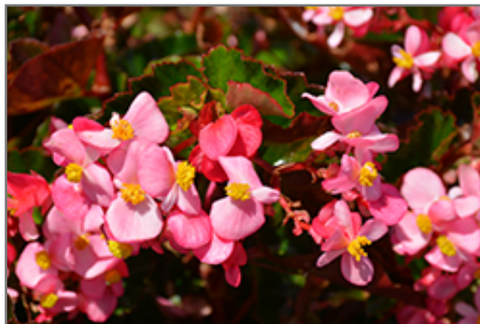
BabyWing Pink Begonia flowers

This is a high maintenance plant that will require regular care and upkeep, and usually looks its best without pruning, although it will tolerate pruning. Deer don't particularly care for this plant and will usually leave it alone in favor of tastier treats. Gardeners should be aware of the following characteristic(s) that may warrant special consideration;