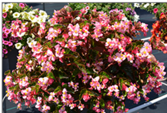
BabyWing Pink Begonia in bloom

BabyWing Pink Begonia is a fine choice for the garden, but it is also a good selection for planting in outdoor containers and hanging baskets. It is often used as a 'filler' in the 'spiller-thriller-filler' container combination, providing a mass of flowers and foliage against which the thriller plants stand out. Note that when growing plants in outdoor containers and baskets, they may require more frequent waterings than they would in the yard or garden.