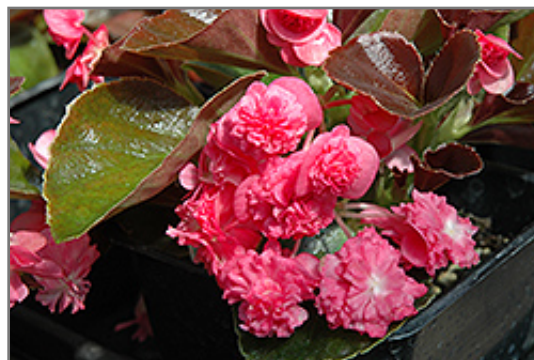
Doublet Rose Begonia flowers