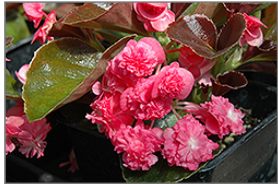
Doublet Rose Begonia flowers