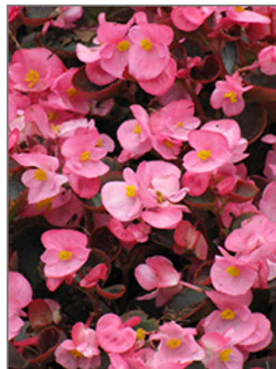
Bada Boom Pink Begonia flowers