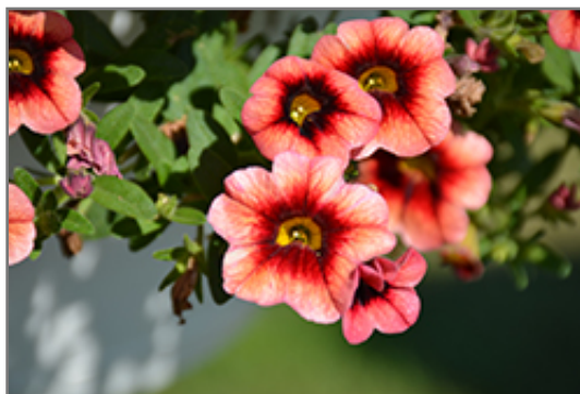
Superbells Coralberry Punch Calibrachoa flowers

Superbells Coralberry Punch Calibrachoa is a dense herbaceous annual with a trailing habit of growth, eventually spilling over the edges of hanging baskets and containers. Its medium texture blends into the garden, but can always be balanced by a couple of finer or coarser plants for an effective composition.