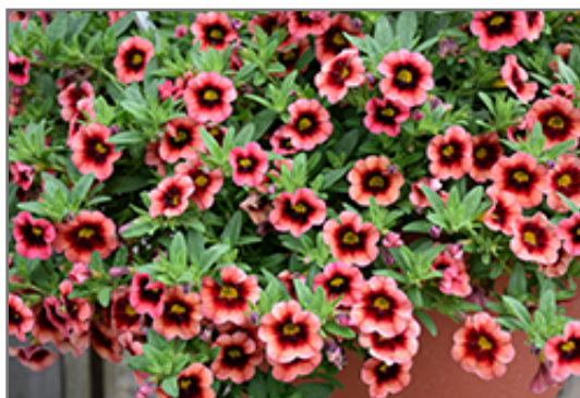
Superbells Coralberry Punch Calibrachoa flowers