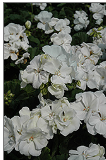
Tango White Geranium flowers