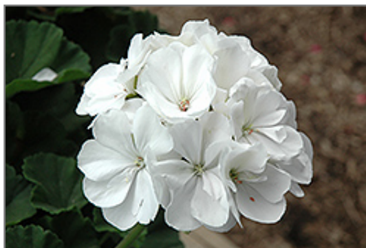
Tango White Geranium flowers