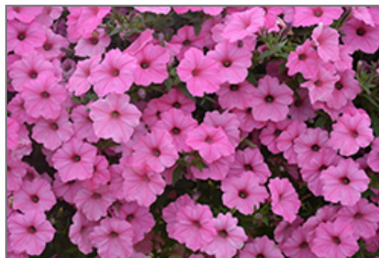
Supertunia Vista Bubblegum Petunia flowers