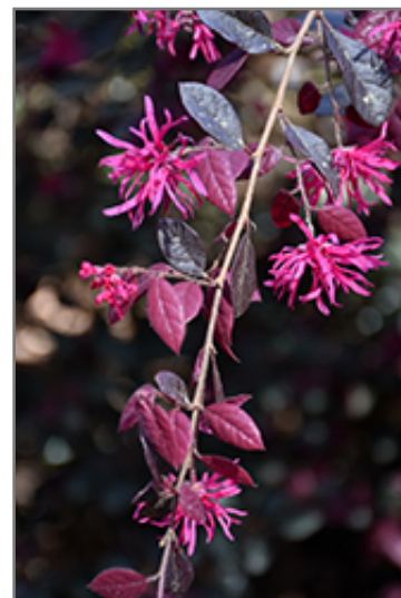
Purple Diamond Fringeflower flowers

Purple Diamond Fringeflower is recommended for the following landscape applications;