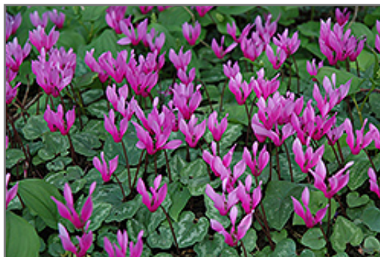
Purple Cyclamen in bloom