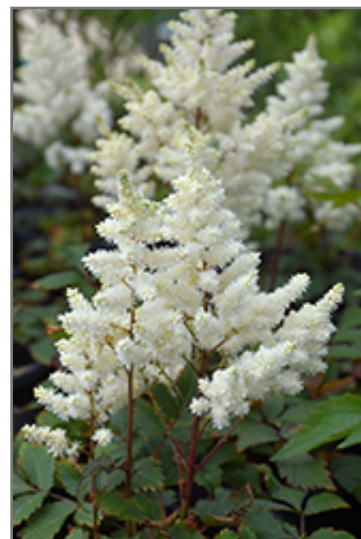
Younique White Astilbe flowers

Feathery, elegant white plumes, rise above dense foliage; best in a shady spot with dappled light; prefers moisture so water regularly for abundant flowers and nice foliage; perfect for mixed containers; plume heads can be left for winter interest