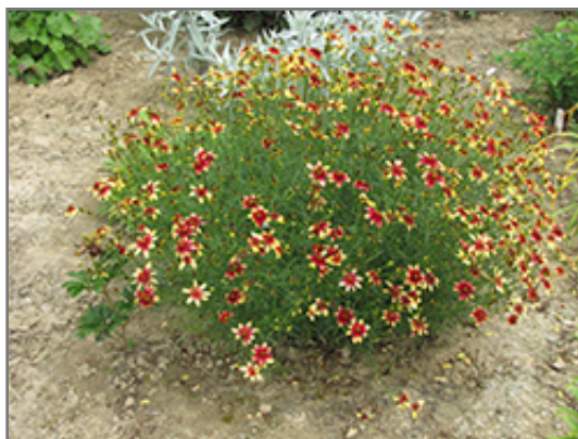
Route 66 Tickseed