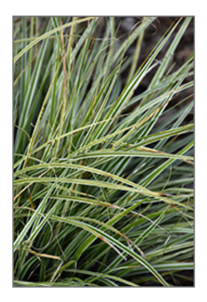
EverColor Everest Japanese Sedge foliage

EverColor Everest Japanese Sedge is recommended for the following landscape applications;