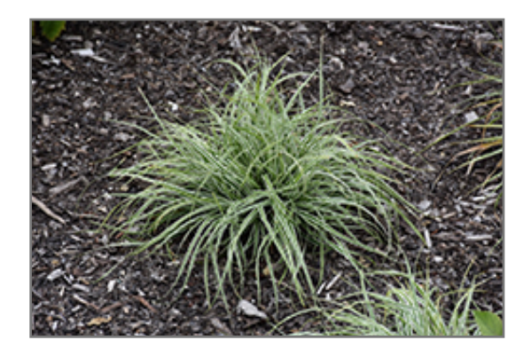
EverColor Everest Japanese Sedge

This is a relatively low maintenance plant, and is best cleaned up in early spring before it resumes active growth for the season. It has no significant negative characteristics.