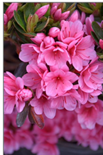
Coral Bells Azalea flowers