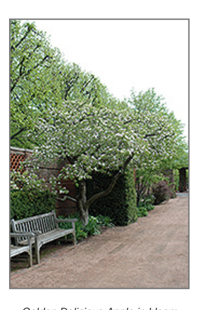
Golden Delicious Apple in bloom

This tree is typically grown in a designated area of the yard because of its mature size and spread. It should only be grown in full sunlight. It prefers to grow in average to moist conditions, and shouldn't be allowed to dry out. It may require supplemental watering during periods of drought or extended heat. It is not particular as to soil type or pH. It is highly tolerant of urban pollution and will even thrive in inner city environments. This particular variety is an interspecific hybrid.