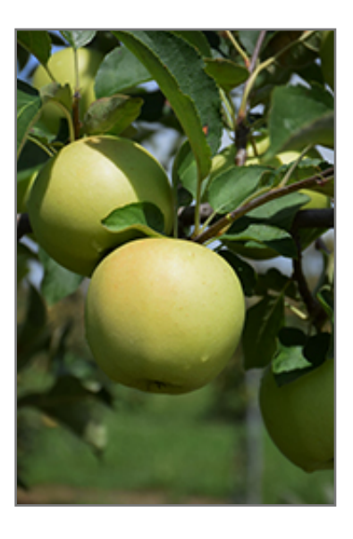
Golden Delicious Apple fruit

Golden Delicious Apple features showy clusters of lightly-scented white flowers with shell pink overtones along the branches in mid spring, which emerge from distinctive pink flower buds. It has forest green deciduous foliage. The pointy leaves turn yellow in fall. The fruits are showy chartreuse apples with yellow overtones, which are carried in abundance in mid fall. The fruit can be messy if allowed to drop on the lawn or walkways, and may require occasional clean-up.