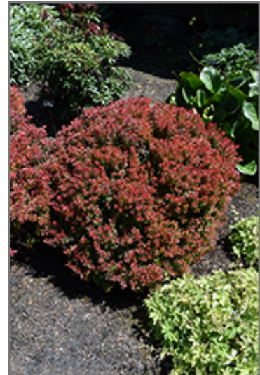
Golden Ruby Barberry