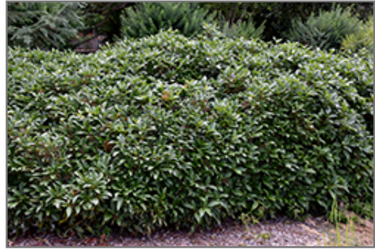
David Viburnum

David Viburnum will grow to be about 4 feet tall at maturity, with a spread of 4 feet. It tends to fill out right to the ground and therefore doesn't necessarily require facer plants in front. It grows at a medium rate, and under ideal conditions can be expected to live for 40 years or more. This is a female variety of the species which requires a male selection of the same species growing nearby in order to set fruit.