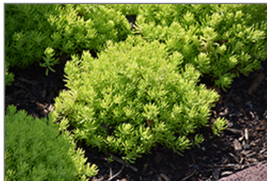
Lemon Coral Stonecrop