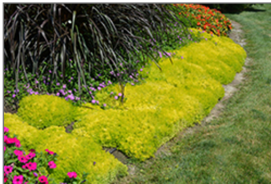
Lemon Coral Stonecrop

Lemon Coral Stonecrop will grow to be about 8 inches tall at maturity, with a spread of 12 inches. When grown in masses or used as a bedding plant, individual plants should be spaced approximately 10 inches apart. Its foliage tends to remain low and dense right to the ground. It grows at a fast rate, and under ideal conditions can be expected to live for approximately 10 years. As an herbaceous perennial, this plant will usually die back to the crown each winter, and will regrow from the base each spring. Be careful not to disturb the crown in late winter when it may not be readily seen!