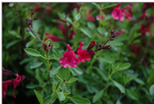
Furman's Red Texas Sage flowers

This is a relatively low maintenance plant, and should only be pruned after flowering to avoid removing any of the current season's flowers. It is a good choice for attracting bees, butterflies and hummingbirds to your yard, but is not particularly attractive to deer who tend to leave it alone in favor of tastier treats. It has no significant negative characteristics.