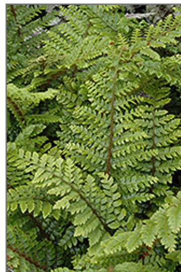
Japanese Tassel Fern foliage