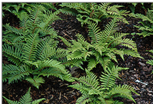
Japanese Tassel Fern

Japanese Tassel Fern is recommended for the following landscape applications;