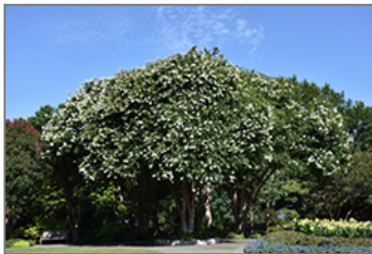
Natchez Crapemyrtle in bloom