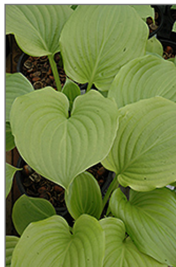
Aphrodite Hosta foliage