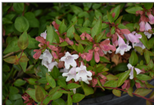
Edward Goucher Abelia flowers

Edward Goucher Abelia is recommended for the following landscape applications;