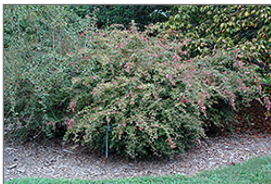
Edward Goucher Abelia in bloom