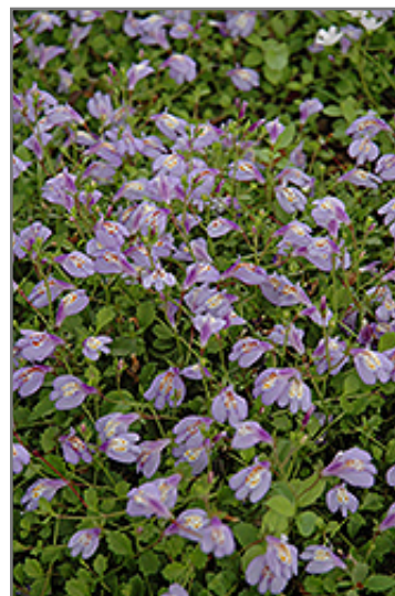
Creeping Mazus flowers

Creeping Mazus is recommended for the following landscape applications;