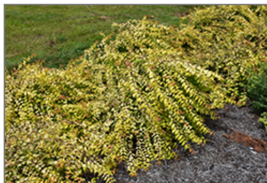
Dream Catcher Beautybush