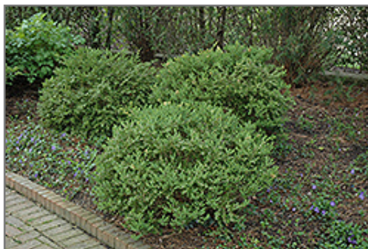
Wintergreen Boxwood