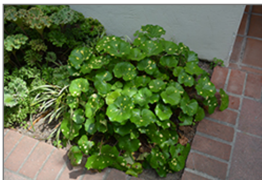
Variegated Leopard Plant