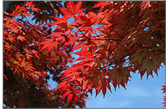
Oshio Beni Japanese Maple foliage

This tree does best in a location that gets morning sunlight but is shaded from the hot afternoon sun, although it will also grow in partial shade. Keep it away from hot, dry locations that receive direct afternoon sun or which get reflected sunlight, such as against the south side of a white wall. It prefers to grow in average to moist conditions, and shouldn't be allowed to dry out. It may require supplemental watering during periods of drought or extended heat. It is not particular as to soil pH, but grows best in rich soils. It is somewhat tolerant of urban pollution, and will benefit from being planted in a relatively sheltered location. Consider applying a thick mulch around the root zone in winter to protect it in exposed locations or colder microclimates. This is a selected variety of a species not originally from North America.