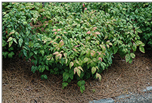
Fire Power Nandina