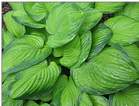
Guacamole Hosta foliage