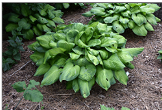
Guacamole Hosta