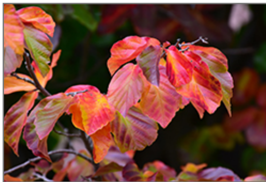
Persian Lace in fall