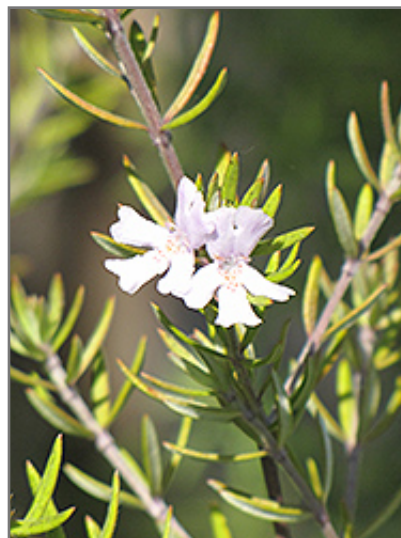
Coast Rosemary flowers