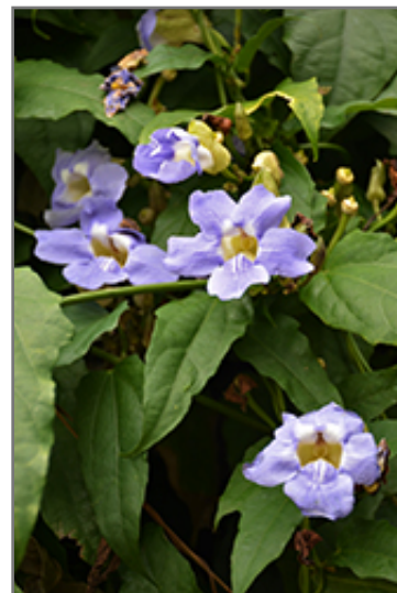
Blue Trumpet Vine flowers