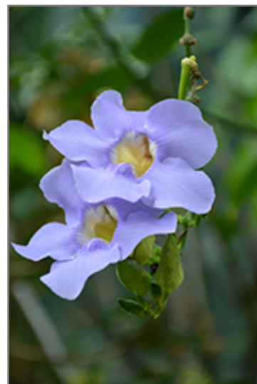
Blue Trumpet Vine flowers

Blue Trumpet Vine is recommended for the following landscape applications;