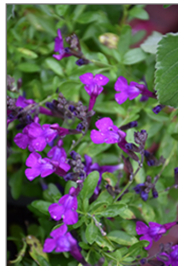
Mirage Deep Purple Autumn Sage flowers

This is a relatively low maintenance plant, and should only be pruned after flowering to avoid removing any of the current season's flowers. It is a good choice for attracting bees, butterflies and hummingbirds to your yard, but is not particularly attractive to deer who tend to leave it alone in favor of tastier treats. It has no significant negative characteristics.