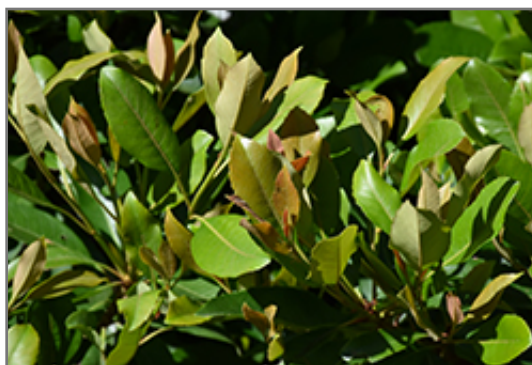
Coppertone Loquat foliage