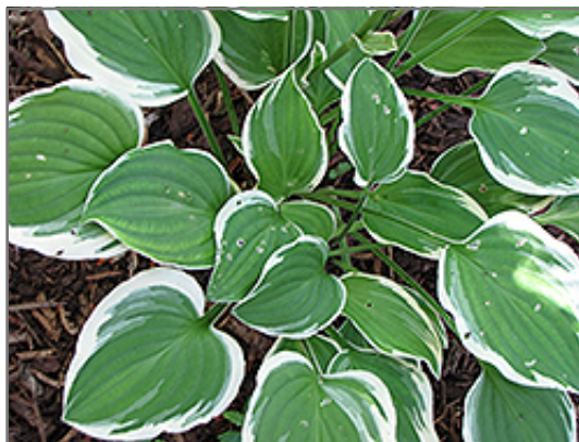
Diamond Tiara Hosta foliage

Diamond Tiara Hosta will grow to be about 12 inches tall at maturity extending to 18 inches tall with the flowers, with a spread of 24 inches. When grown in masses or used as a bedding plant, individual plants should be spaced approximately 20 inches apart. Its foliage tends to remain dense right to the ground, not requiring facer plants in front. It grows at a medium rate, and under ideal conditions can be expected to live for approximately 10 years. As an herbaceous perennial, this plant will usually die back to the crown each winter, and will regrow from the base each spring. Be careful not to disturb the crown in late winter when it may not be readily seen!