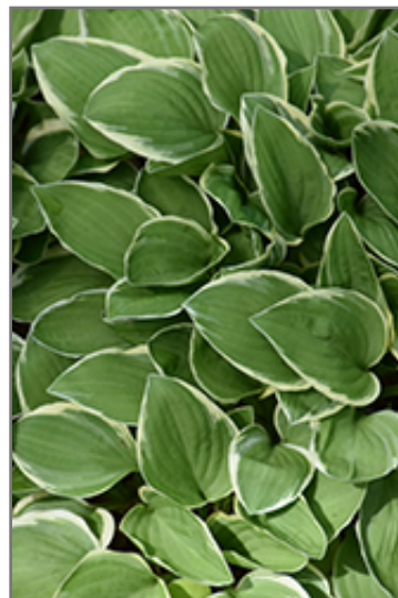
Diamond Tiara Hosta foliage