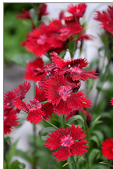
Rockin' Red Pinks flowers