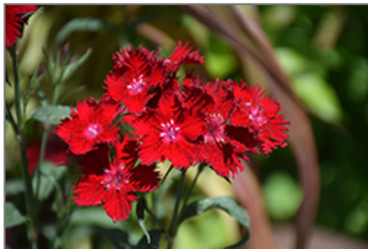
Rockin' Red Pinks flowers

This is a relatively low maintenance plant, and is best cleaned up in early spring before it resumes active growth for the season. It is a good choice for attracting bees and butterflies to your yard, but is not particularly attractive to deer who tend to leave it alone in favor of tastier treats. It has no significant negative characteristics.