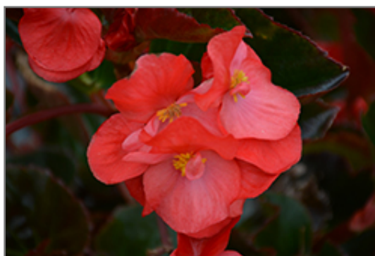
Megawatt Red Bronze Leaf Begonia flowers