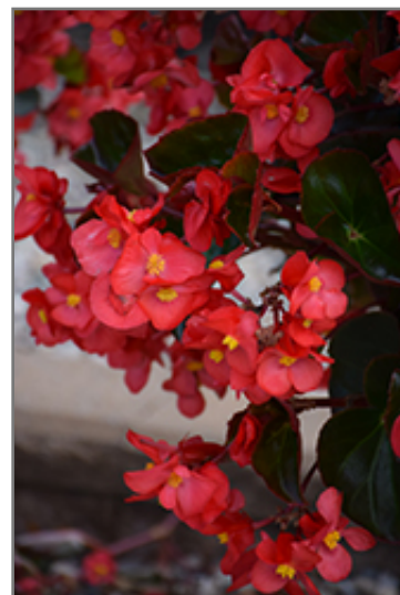
Megawatt Red Bronze Leaf Begonia flowers

Megawatt Red Bronze Leaf Begonia is an herbaceous evergreen perennial with an upright spreading habit of growth. Its medium texture blends into the garden, but can always be balanced by a couple of finer or coarser plants for an effective composition.