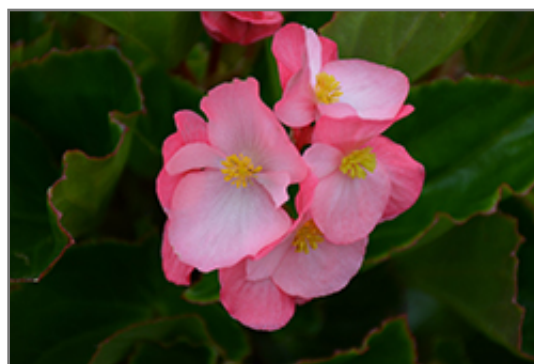
Megawatt Pink Green Leaf Begonia flowers