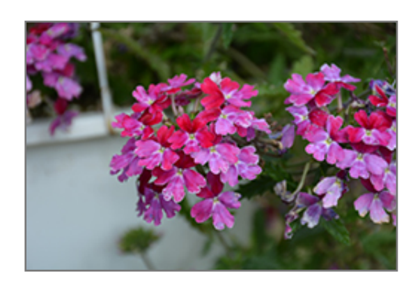
Lanai Twister Burgundy Verbena flowers