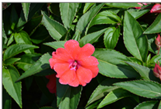
Bounce Bright Coral Impatiens flowers