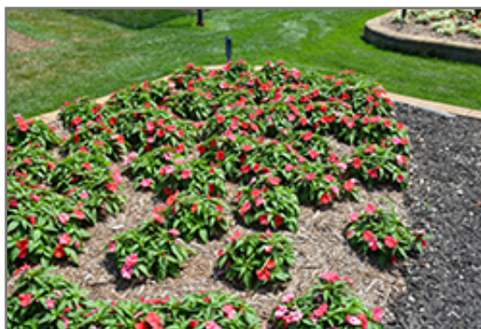
Bounce Bright Coral Impatiens in bloom