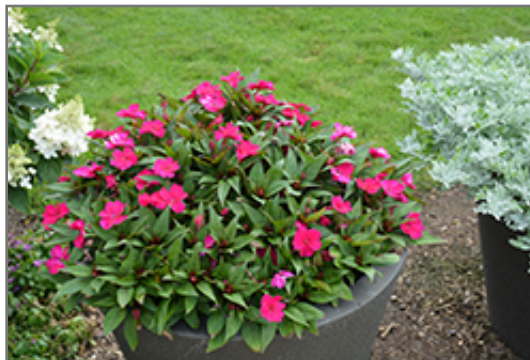
SunPatiens Compact Neon Pink New Guinea Impatiens in bloom

SunPatiens Compact Neon Pink New Guinea Impatiens will grow to be about 24 inches tall at maturity, with a spread of 24 inches. When grown in masses or used as a bedding plant, individual plants should be spaced approximately 20 inches apart. Its foliage tends to remain dense right to the ground, not requiring facer plants in front. This fast-growing annual will normally live for one full growing season, needing replacement the following year.