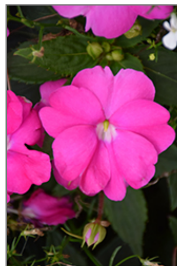
SunPatiens Compact Neon Pink New Guinea Impatiens flowers

This plant will require occasional maintenance and upkeep, and should not require much pruning, except when necessary, such as to remove dieback. It is a good choice for attracting bees and butterflies to your yard. It has no significant negative characteristics.