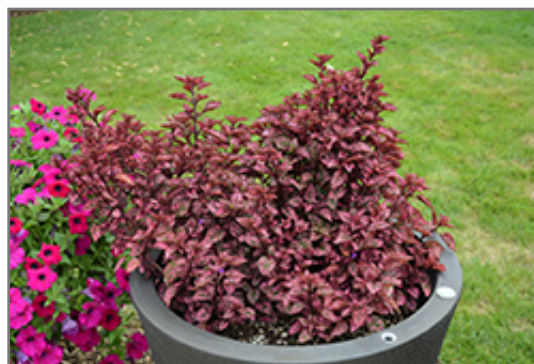
Hippo Rose Polka Dot Plant