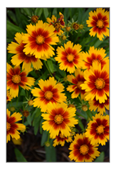
UpTick Gold and Bronze Tickseed flowers

2974 Johnston St., Lafayette, LA 70503 (337) 264-1418 buyallseasons.com