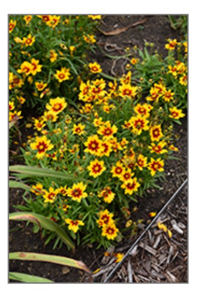
UpTick Gold and Bronze Tickseed in bloom

UpTick Gold and Bronze Tickseed is a fine choice for the garden, but it is also a good selection for planting in outdoor pots and containers. It is often used as a 'filler' in the 'spiller-thriller-filler' container combination, providing a mass of flowers against which the thriller plants stand out. Note that when growing plants in outdoor containers and baskets, they may require more frequent waterings than they would in the yard or garden.