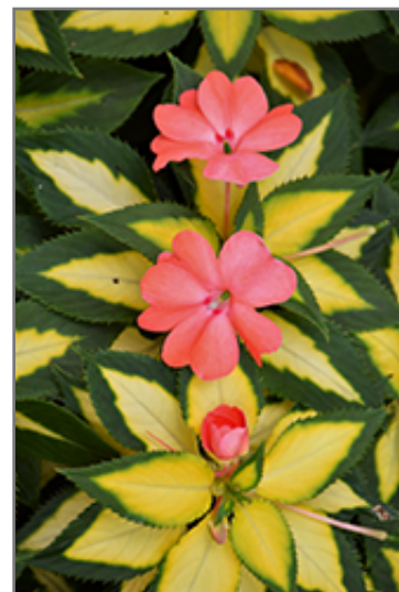
SunPatiens Spreading Salmon New Guinea Impatiens flowers

This plant will require occasional maintenance and upkeep, and should not require much pruning, except when necessary, such as to remove dieback. It is a good choice for attracting bees and butterflies to your yard. It has no significant negative characteristics.