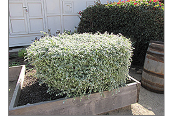
Licorice Plant

Heat and drought tolerant, excellent for hot and sunny borders, beds, hanging baskets and containers; produces trailing stems of velvety silver foliage with a slight licorice fragrance; easy to grow and low maintenance